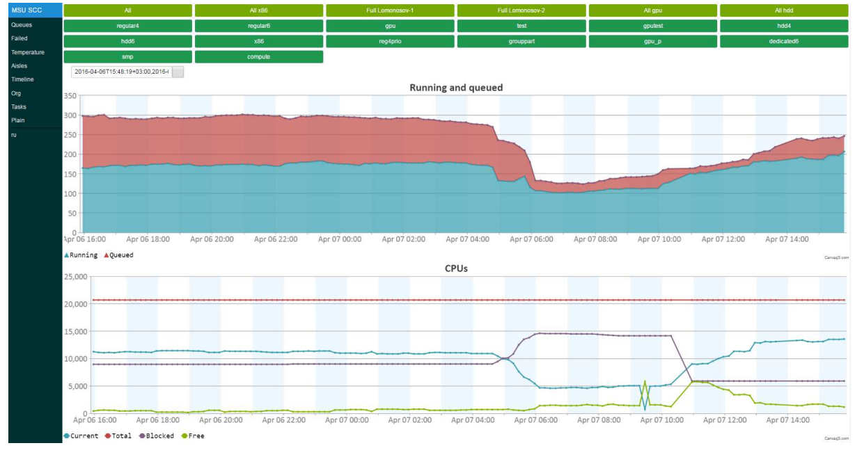
Figure 3. "Lomonosov" system visualization sample: jobs in a queue and utilized core number timeline

An example of slim-based code to display a set of available queues as controls, queue load graph and average number of CPU (cores) utilization