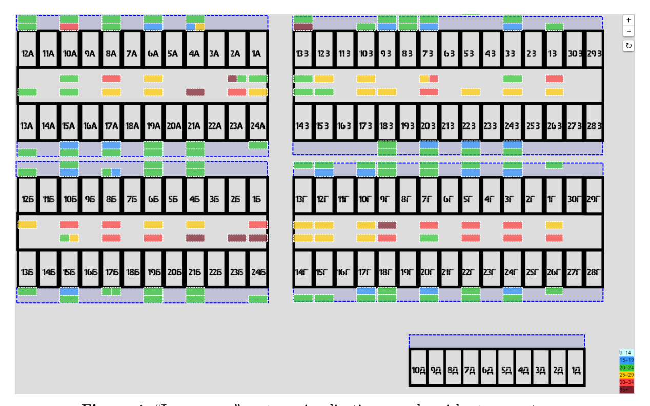
Figure 4. "Lomonosov" system visualization sample: aisles temperatures

The next example illustrates the temprature distribution according to the formal model of the HPC system that includes information on aisles and infrastructure racks location, see fig. 4. Temperature sensors are mapped to the racks. There can be a total of four sensors located on each rack: two upper-mounted and two bottom-mounted. The racks with no sensors are actually racks with compute nodes.